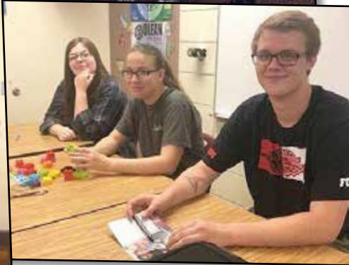
Clockwise from top are representatives from Olean Area Federal Credit Union, Jamestown Business College, and St. Bonaventure University.

students had about becoming a college athlete. The information that was provided will benefit all students whether they are athletes or not.